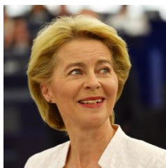
Ursula von der Leyen

The joint European Roadmap towards lifting COVID-19 containment measures, presented by the President of the European Commission and the President of the European Council, responds to the European Council Members' call for an exit strategy that is coordinated with Member States and that will prepare the ground for a comprehensive recovery plan and unprecedented investment.